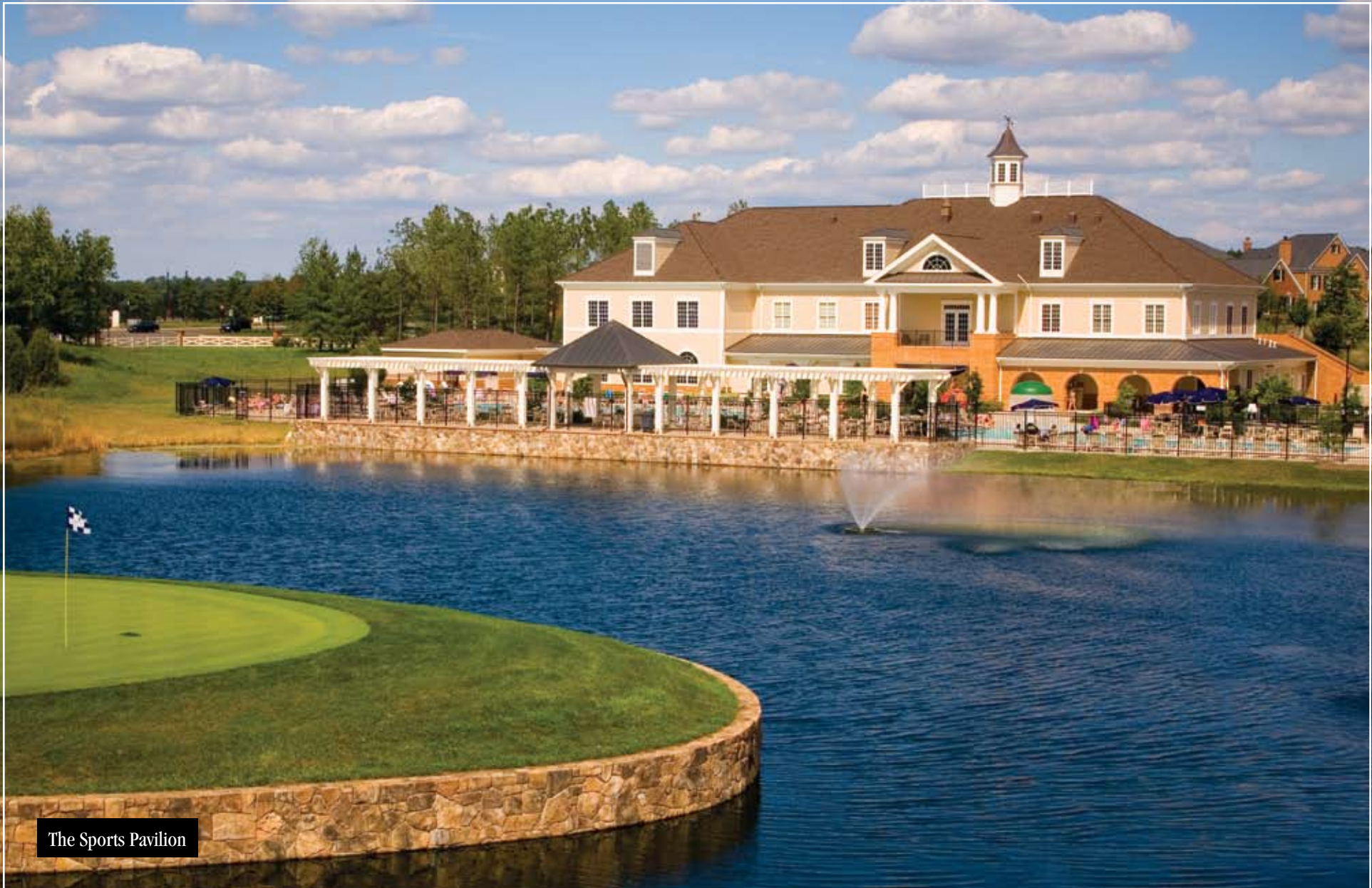
The Sports Pavilion