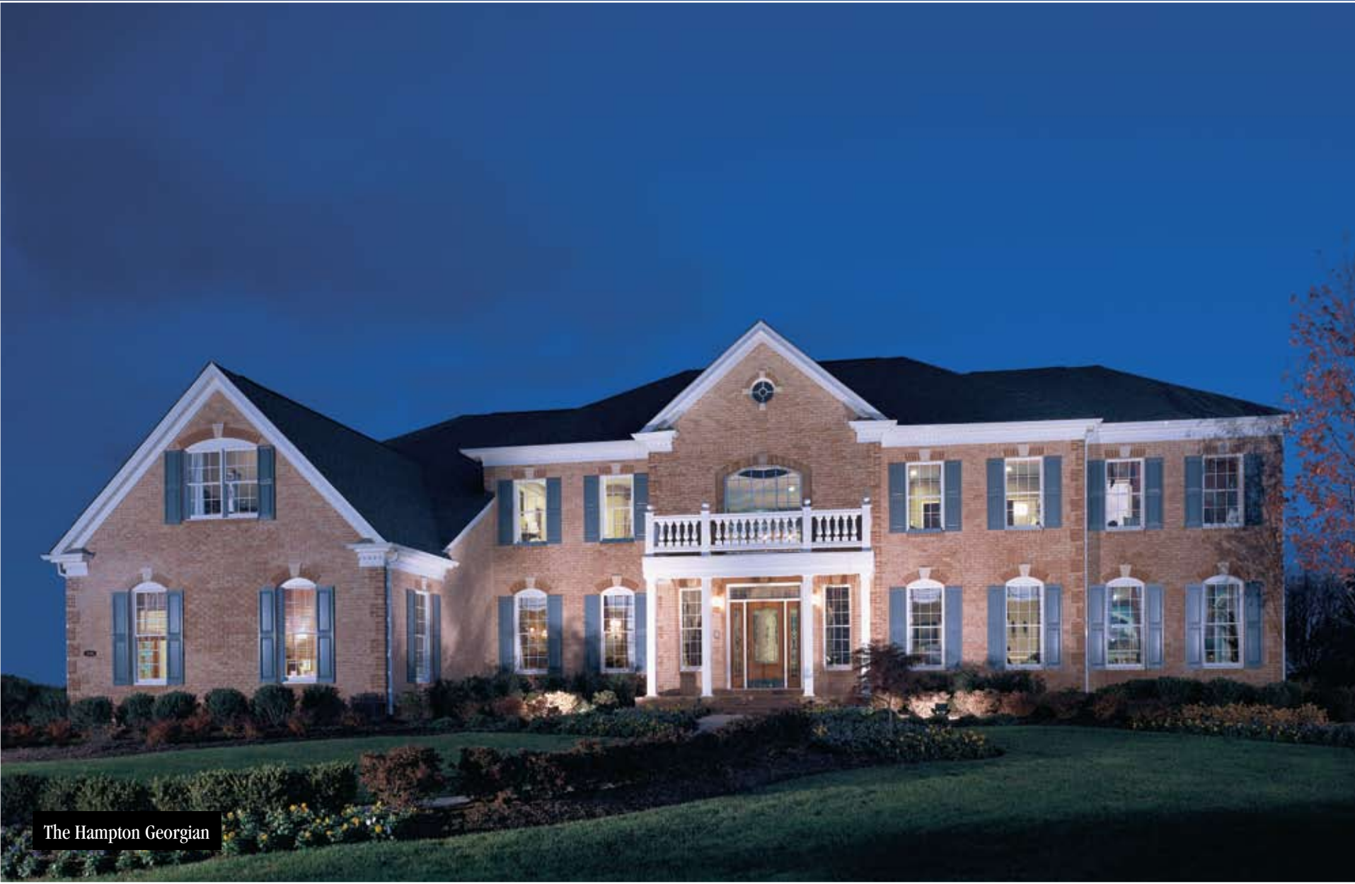
The Hampton Georgian