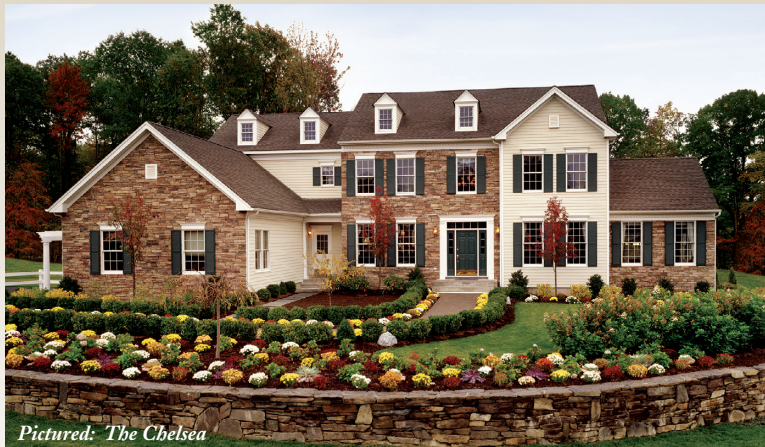
Pictured: The Chelsea

From The Preserve at Hillsborough, turn left onto Pleasant View Road and travel 3/10 mile and turn left onto Rt. 601. Proceed on Rt. 601 for 1 mile and turn left onto Rt. 206 North. Travel on Route 206 North for 2 1/2 miles to Amwell Road and turn left. Follow Amwell Road for 2 1/10 miles and turn right onto Beekman Lane. Continue 2 miles and turn left onto Frey Road to the Hillsborough Chase Sales Center.