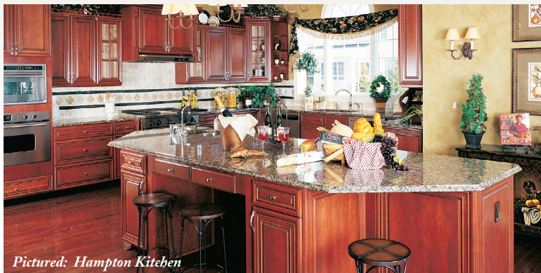
Pictured: Hampton Kitchen

Toll Brothers America's Luxury Home Builder®