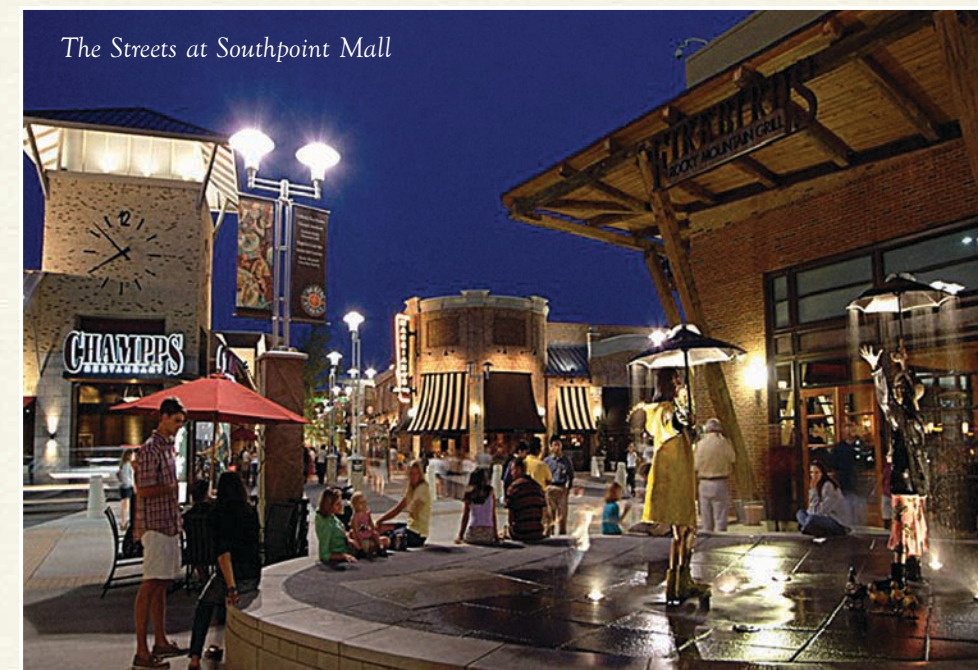
The Streets at Southpoint Mall

Also serving the community of The Hills at Southpoint are houses of worship representing almost all faiths.