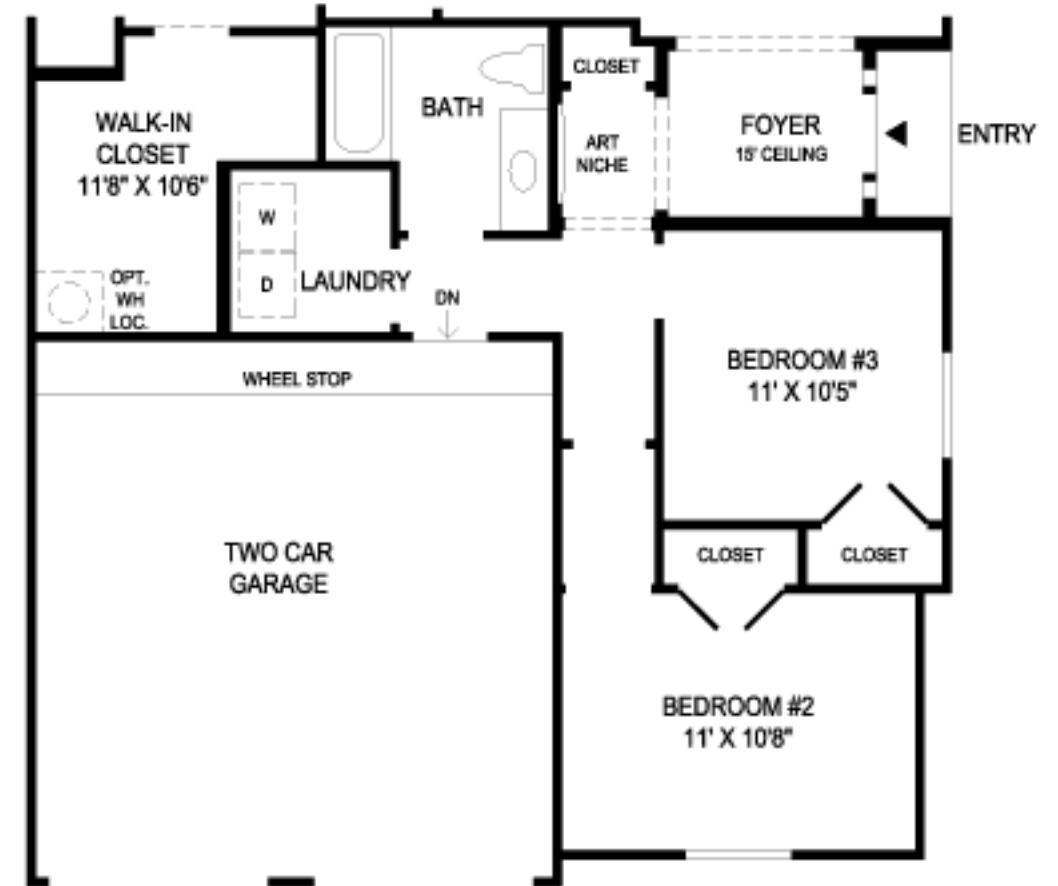
OPTIONAL FIRST FLOOR BEDROOM IN LIEU OF STUDY

Welcoming foyer reveals a 15' ceiling and picturesque art niche. Splendid dining room boasts dramatic ceiling lines and is adjacent to kitchen. Attractive kitchen features large pantry with plant shelf above and angled breakfast bar. Sensational great room offers brilliant window display optional entertainment center and wet bar. Impressive study has a double door entry. Intimate master bedroom suite includes 12' ceiling, magnificent outdoor views, master bath with dual vanities, soaking tub, and spacious walk in closet. 2 bedrooms, 2 baths.