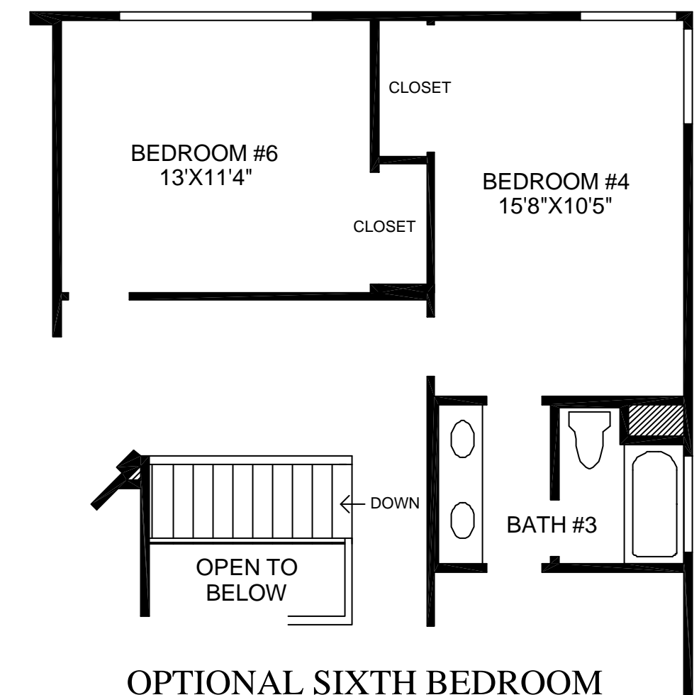
OPTIONAL SIXTH BEDROOM

All room dimensions are approximate, shown to the maximum dimensions of each room, and are subject to field variation. Dimensions should not be used to calculate room square footage. Some windows and floor plans may vary with elevations. Some features may vary from community to community. Please consult a Sales Manager for details. Options purchased must be specified in exhibit B.