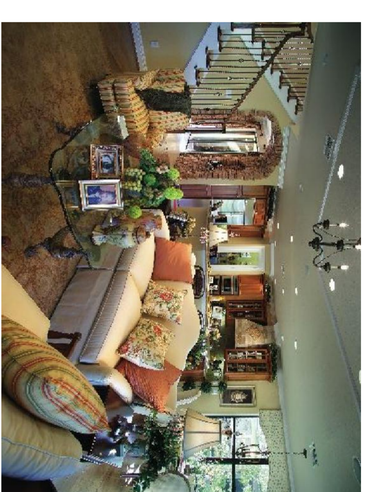
FAMILY ROOM MAY BE SHOWN WITH OPTIONAL FEATURES