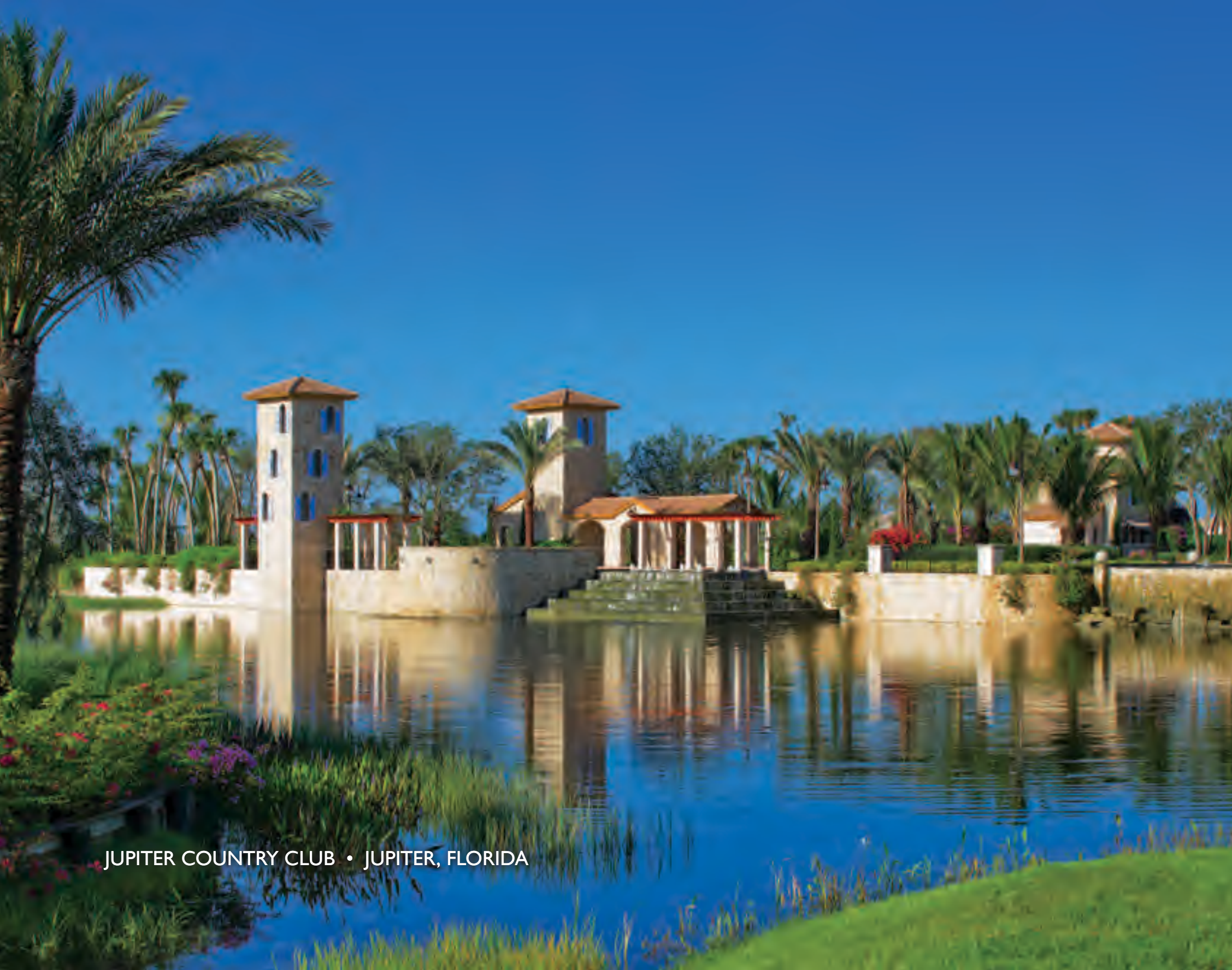
JUPITER COUNTRY CLUB • JUPITER, FLORIDA