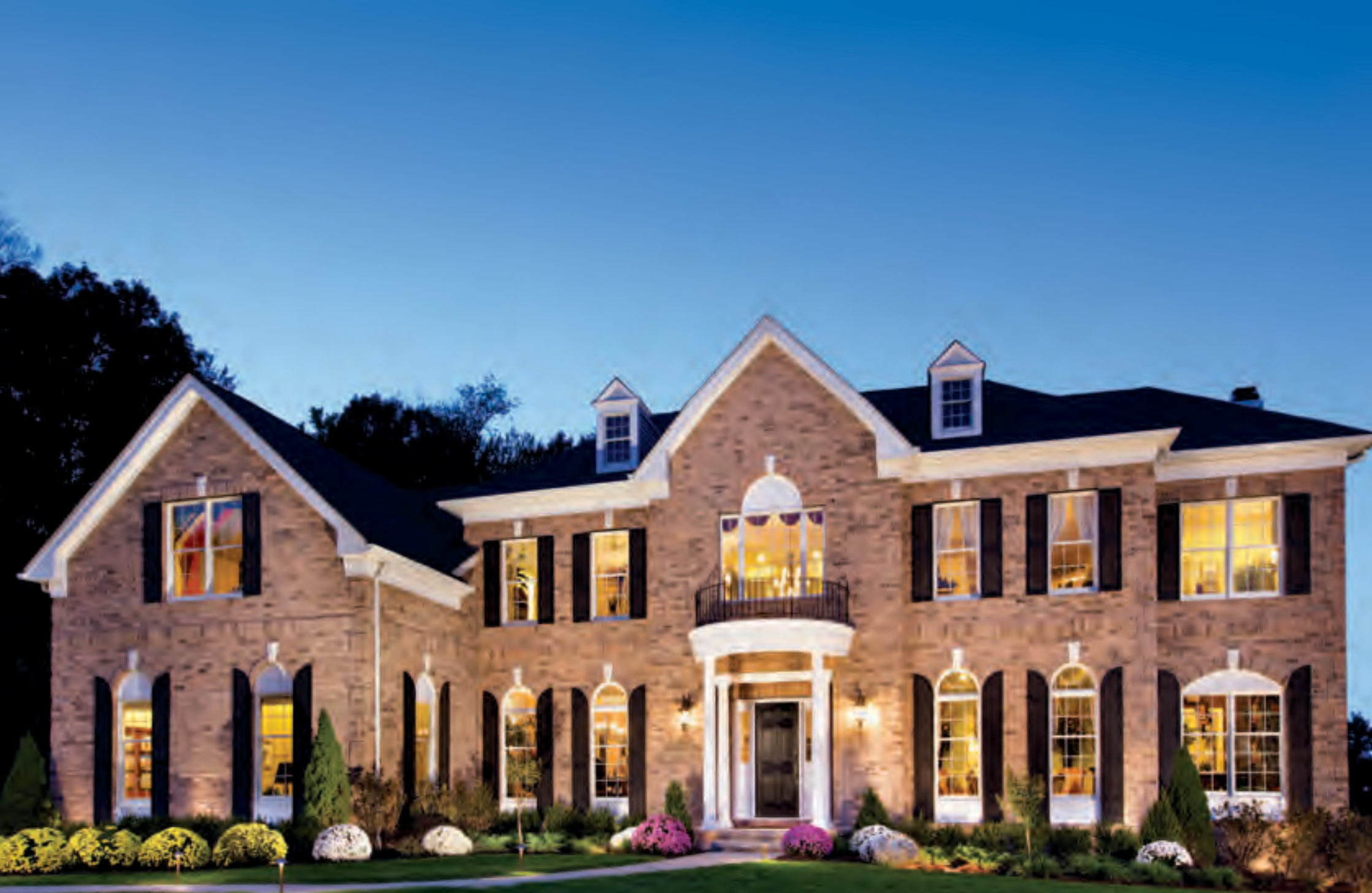
OLD HOPEWELL ESTATES • WAPPINGERS FALLS, NEW YORK