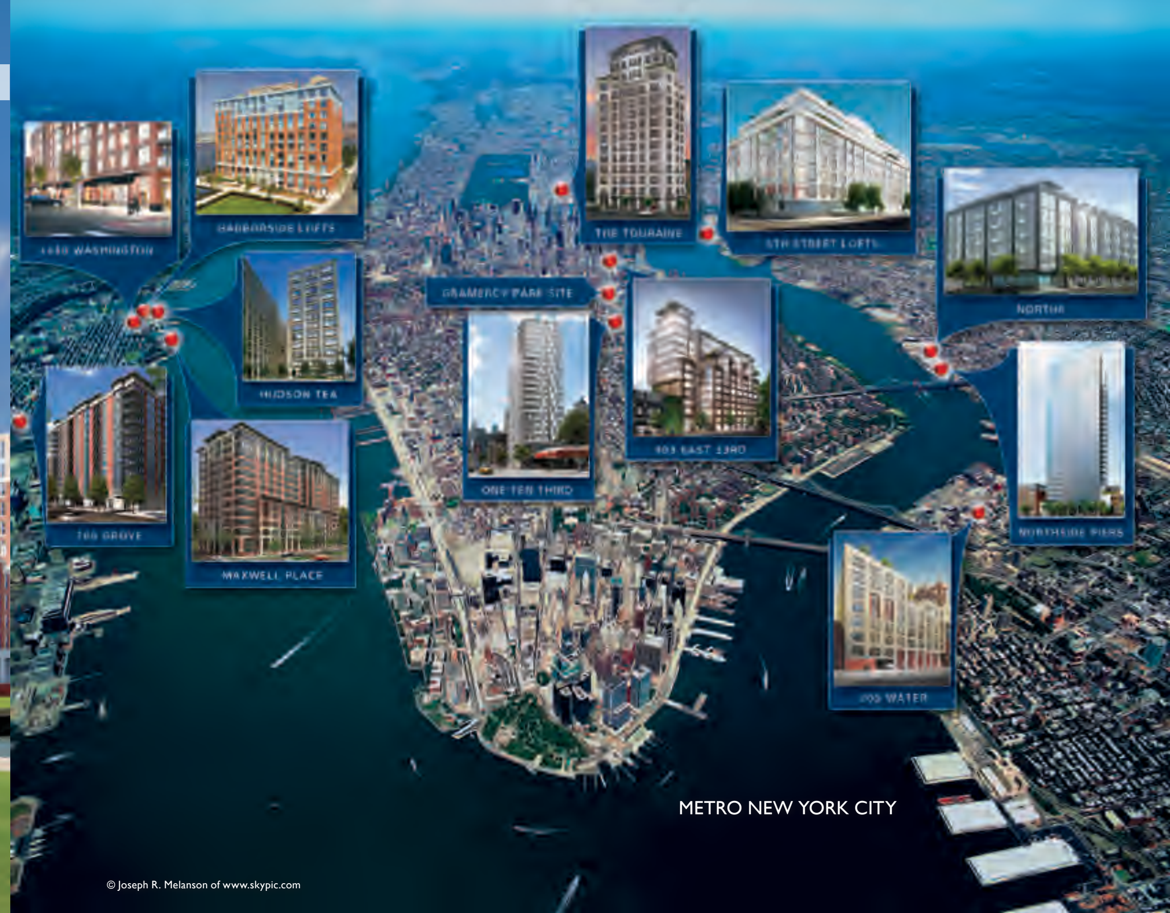
METRO NEW YORK CITY