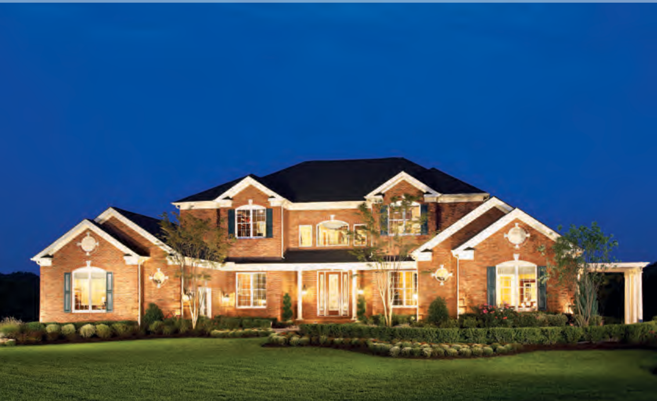
MARLBORO RIDGE • UPPER MARLBORO, MARYLAND