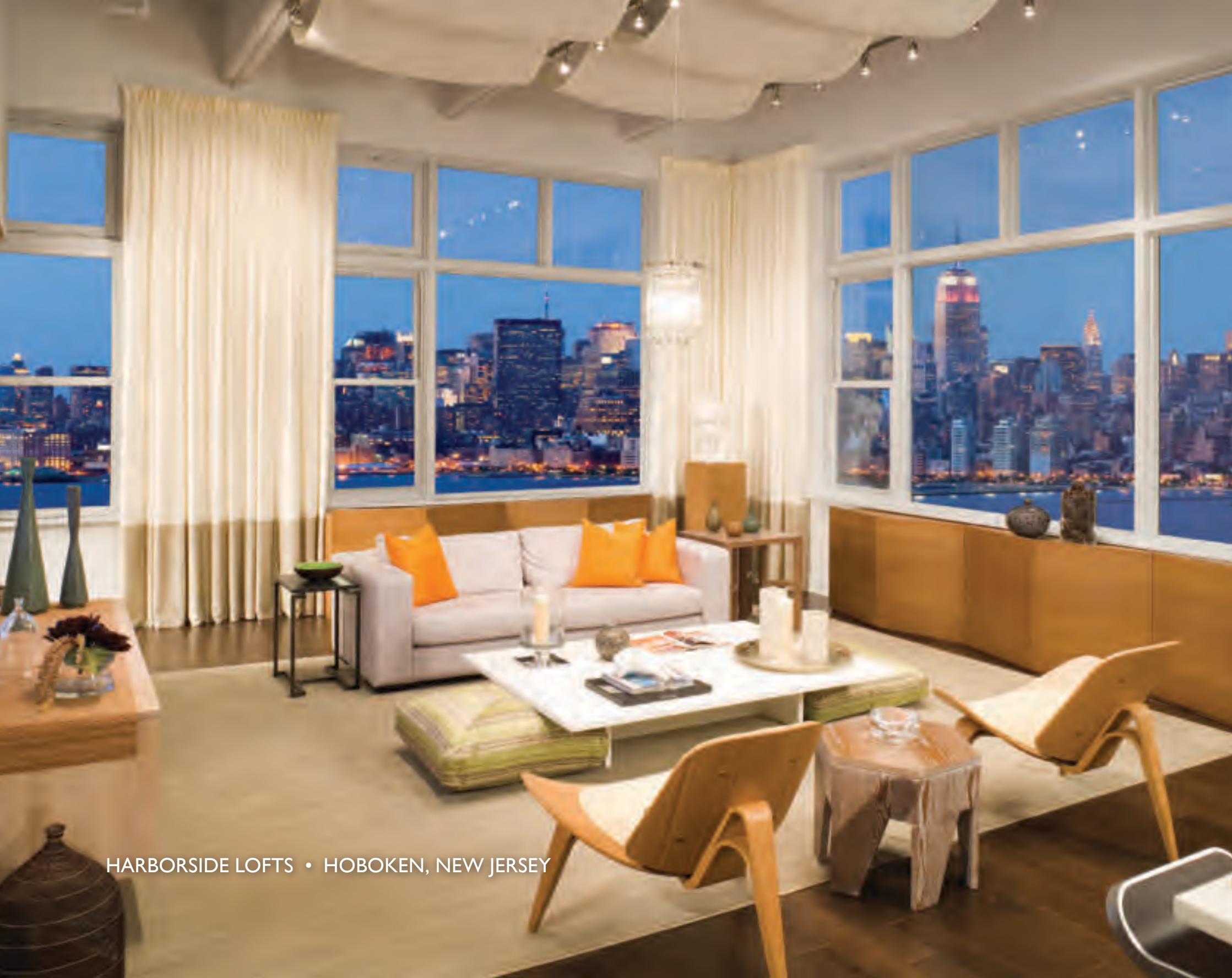
HARBORSIDE LOFTS • HOBOKEN, NEW JERSEY