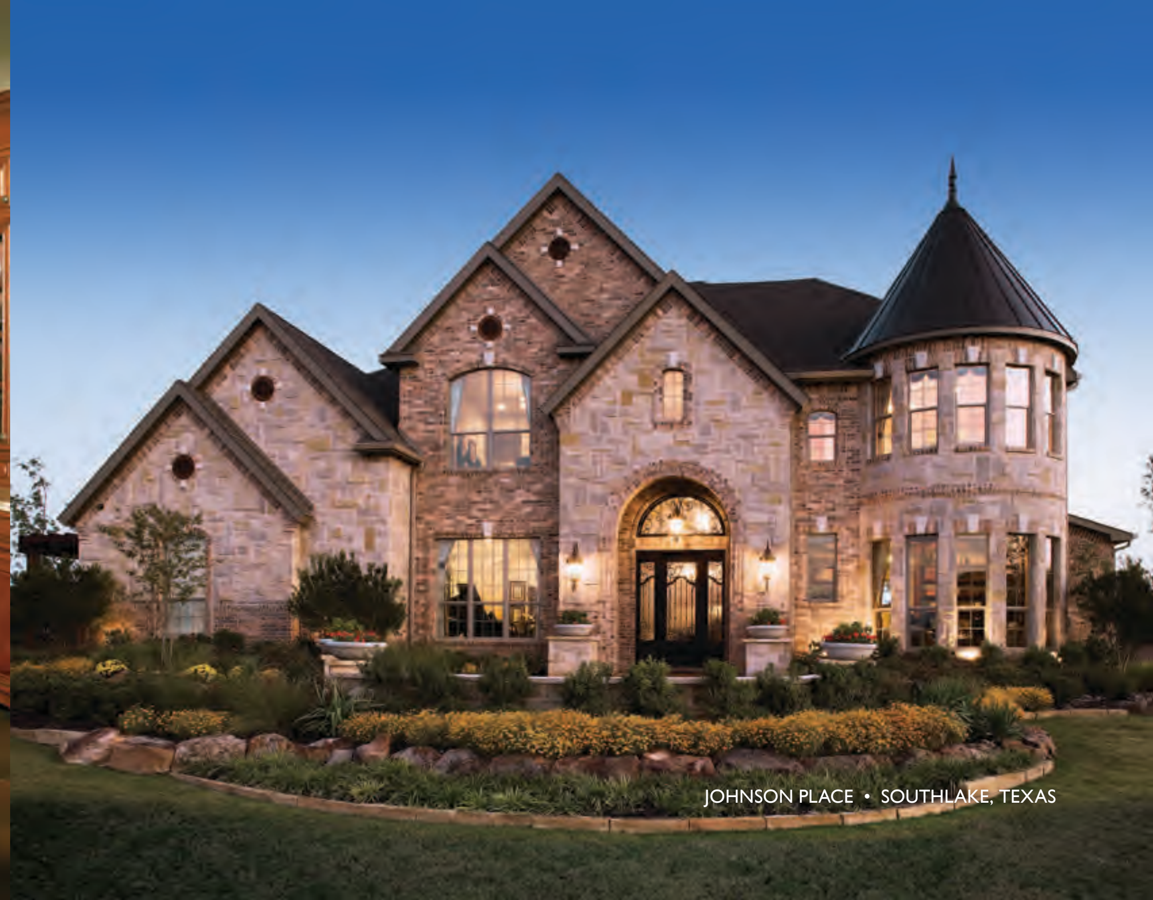
JOHNSON PLACE • SOUTHLAKE, TEXAS