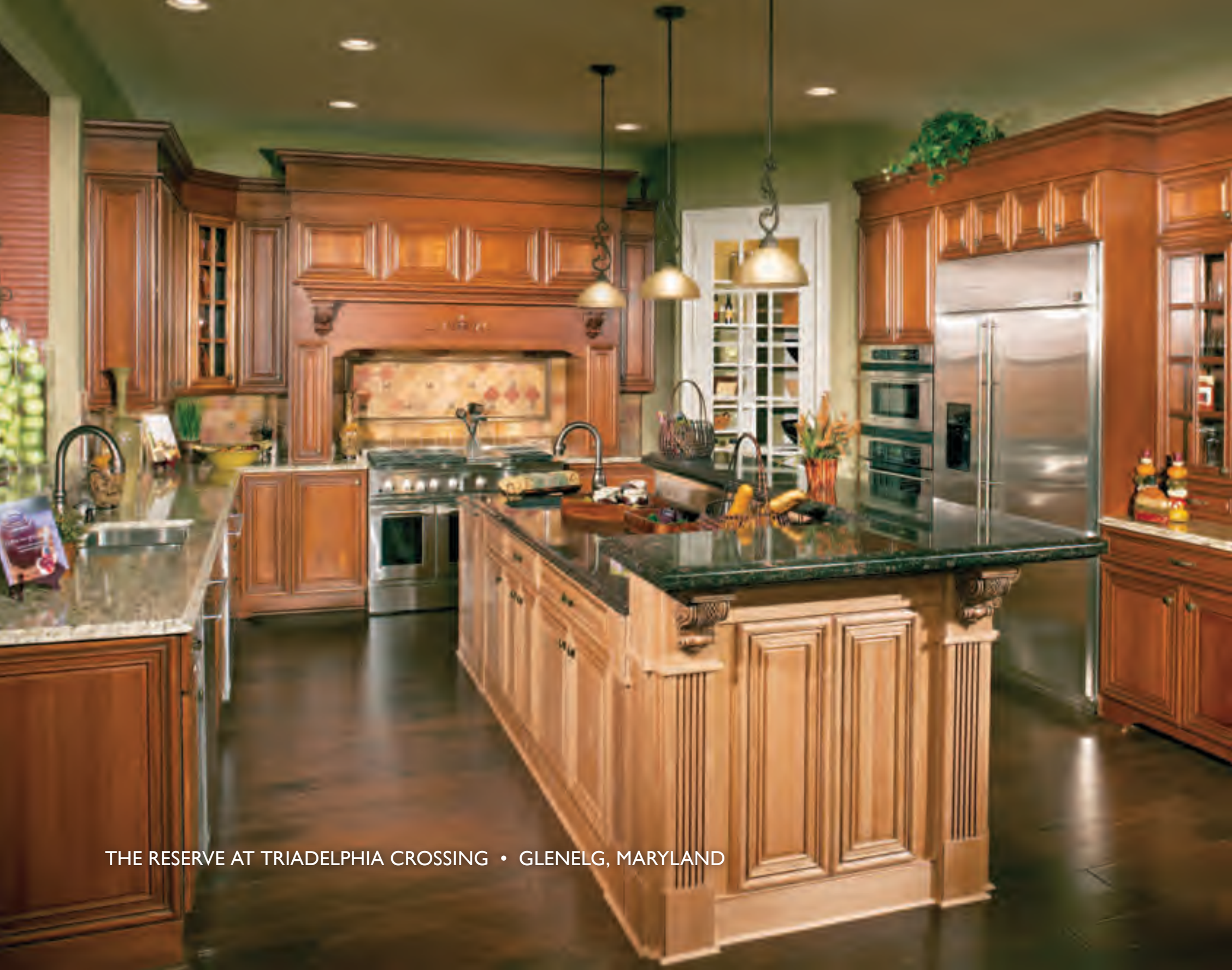
THE RESERVE AT TRIADDELPHIA CROSSING • GLENELG, MARYLAND