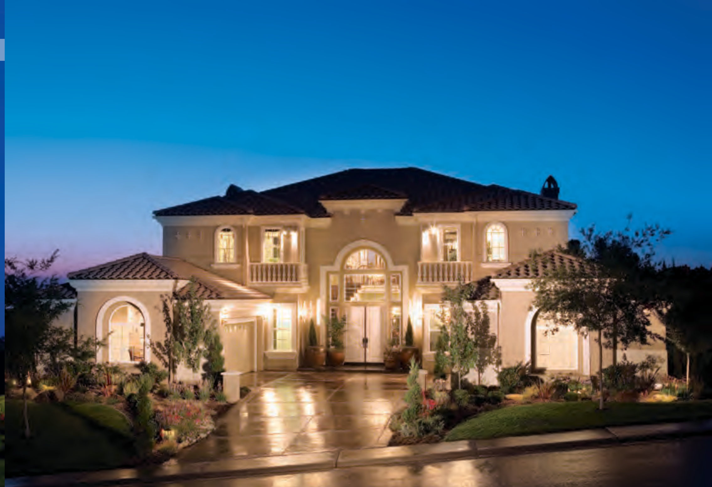
VILLA LAGO AT THE PROMONTORY • EL DORADO HILLS, CALIFORNIA