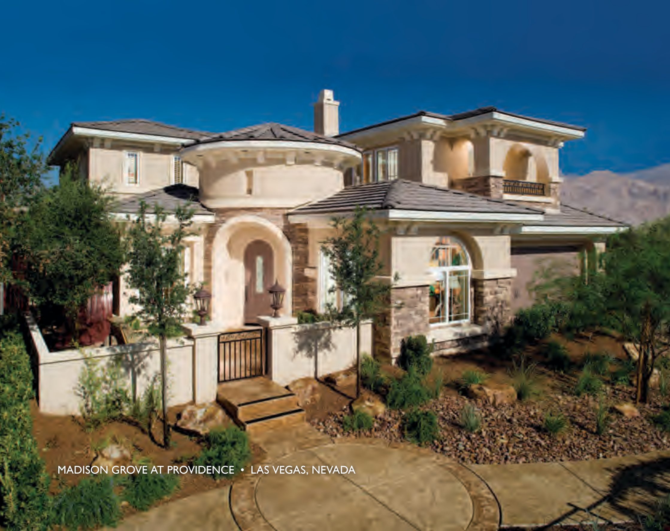
MADISON GROVE AT PROVIDENCE • LAS VEGAS, NEVADA