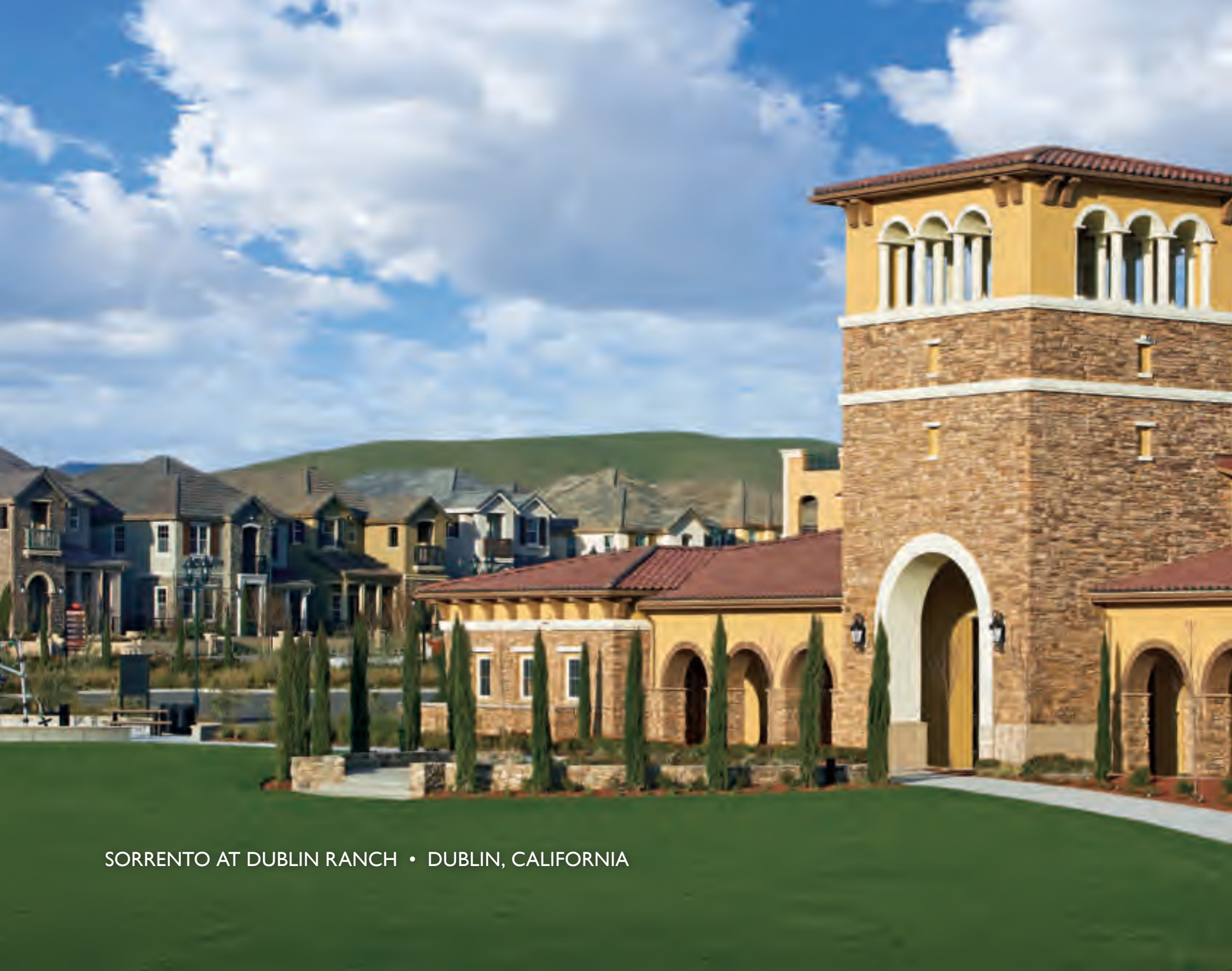
SORRENTO AT DUBLIN RANCH • DUBLIN, CALIFORNIA