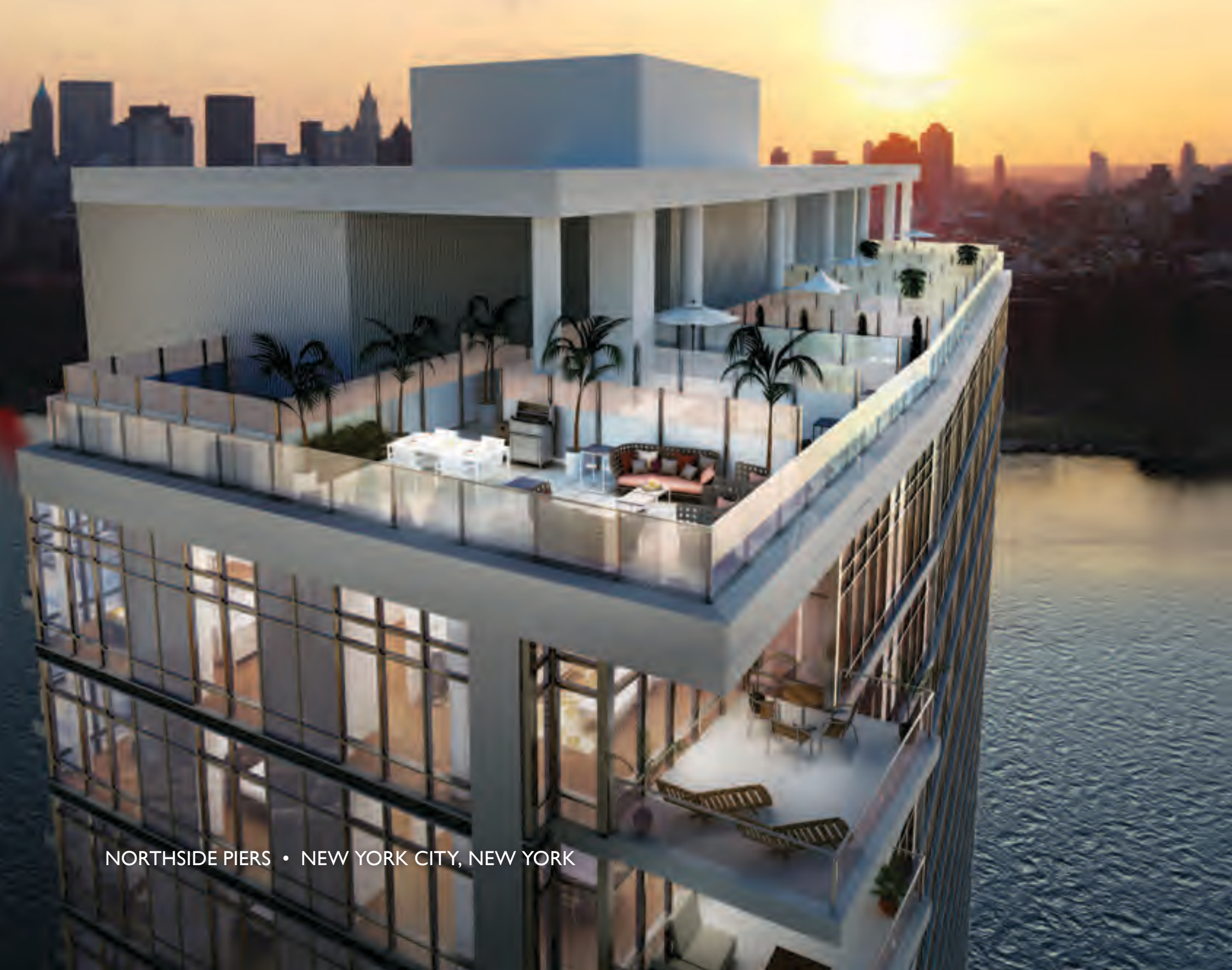
NORTHSIDE PIERS • NEW YORK CITY, NEW YORK