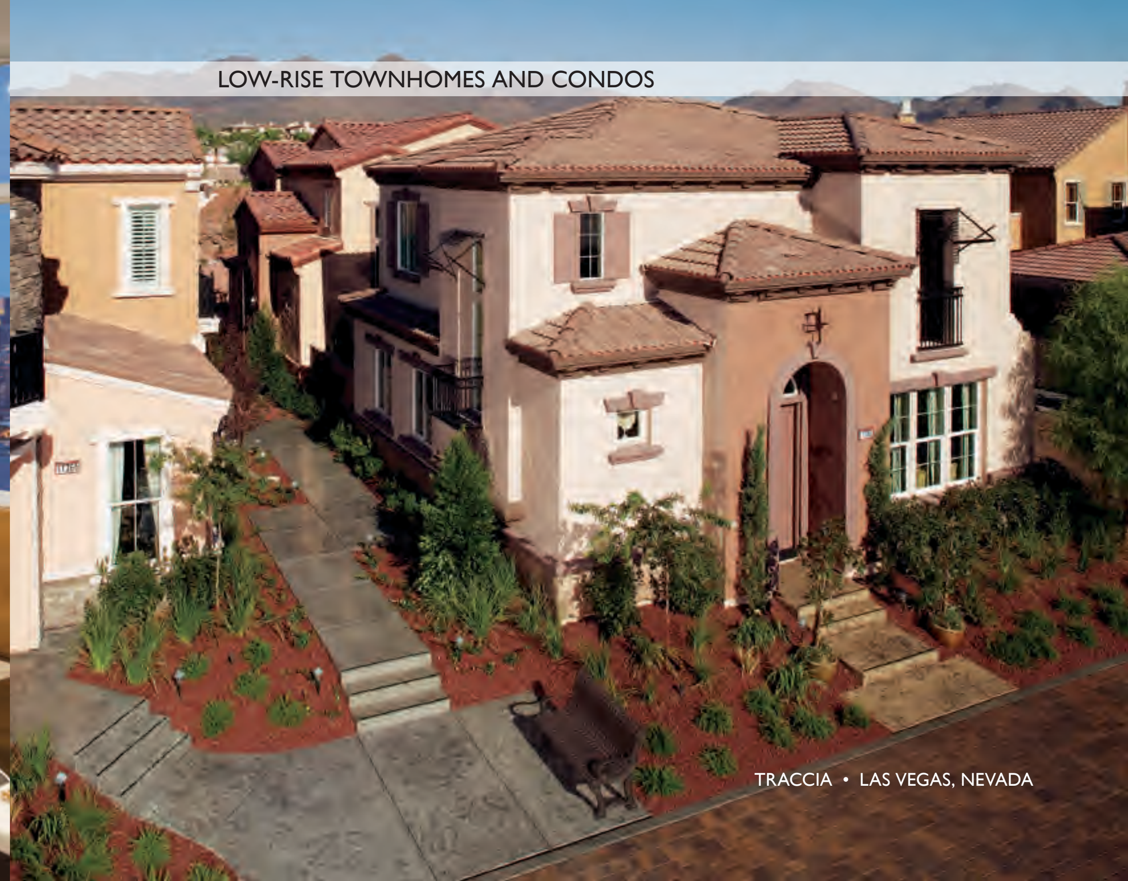
TRACCIA • LAS VEGAS, NEVADA