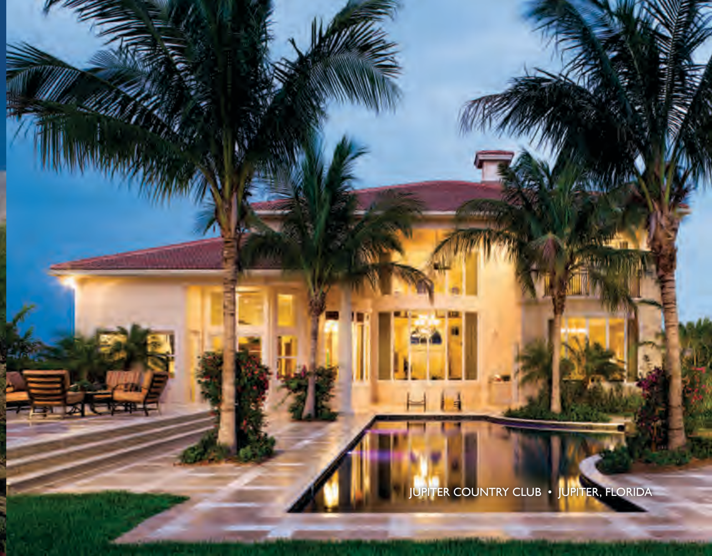
JUPITER COUNTRY CLUB • JUPITER, FLORIDA