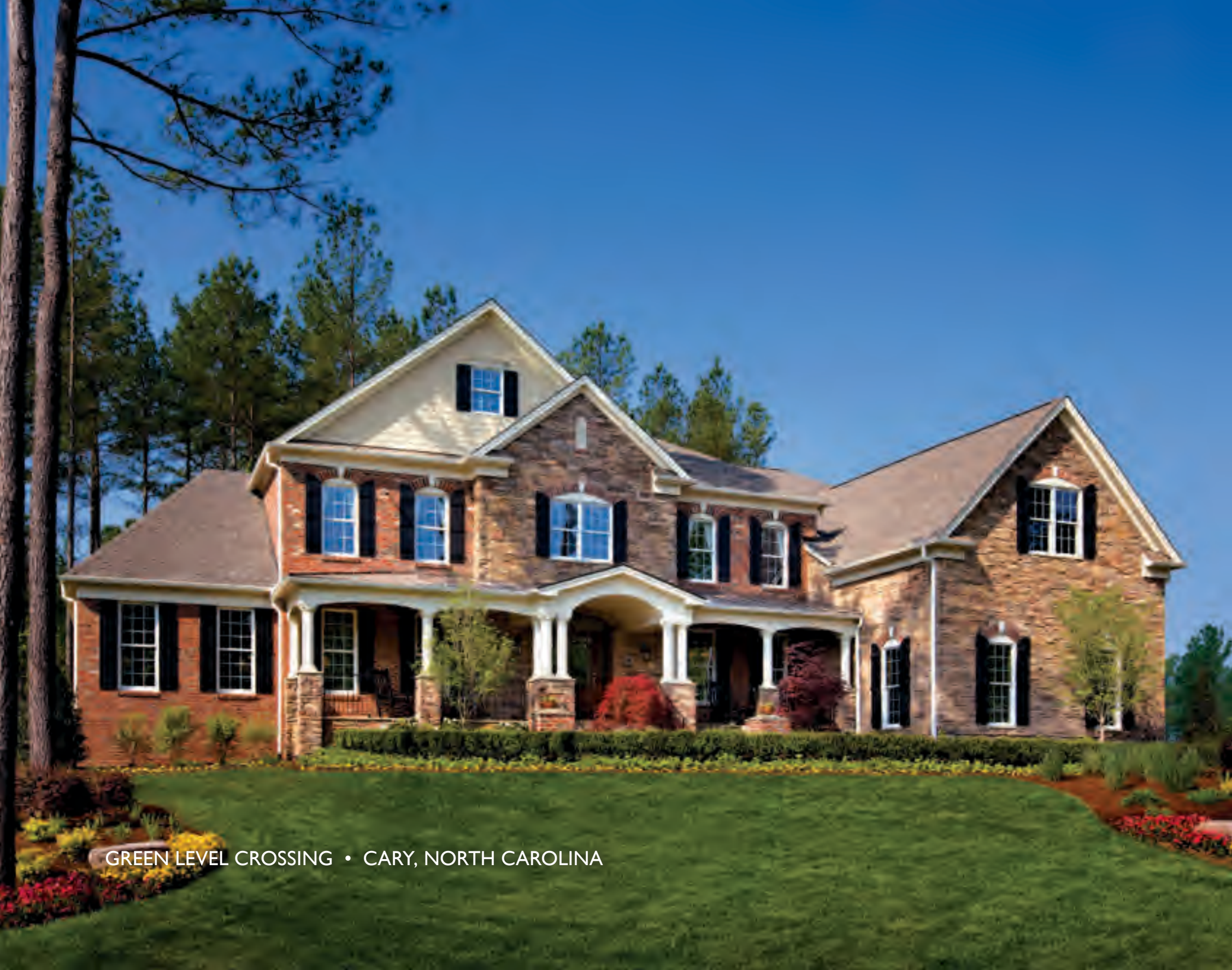
GREEN LEVEL CROSSING • CARY, NORTH CAROLINA