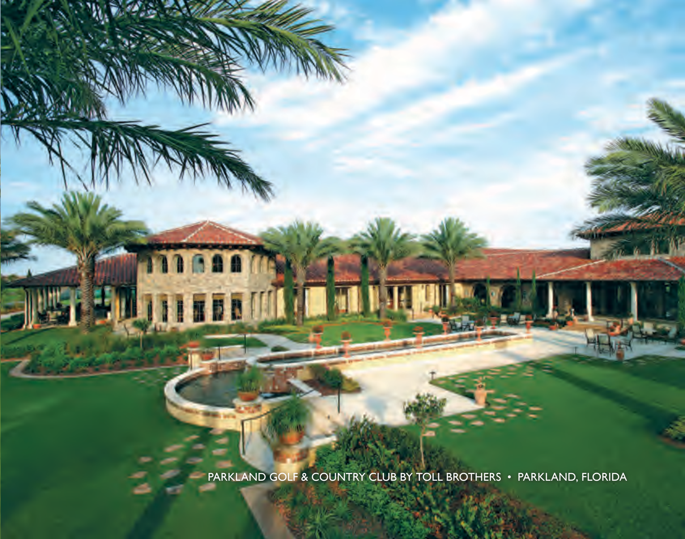
PARKLAND GOLF & COUNTRY CLUB BY TOLL BROTHERS • PARKLAND, FLORIDA