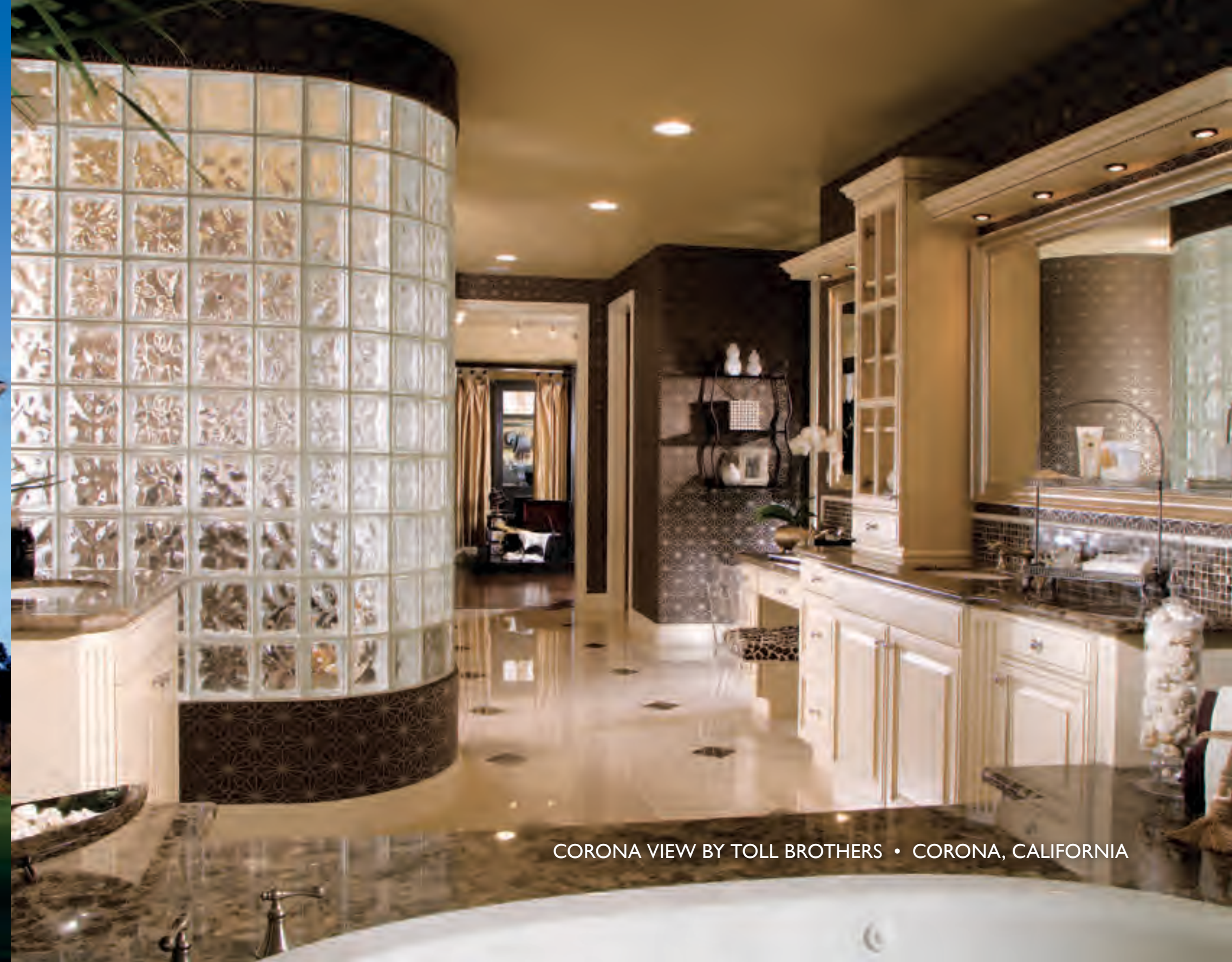
CORONA VIEW BY TOLL BROTHERS • CORONA, CALIFORNIA