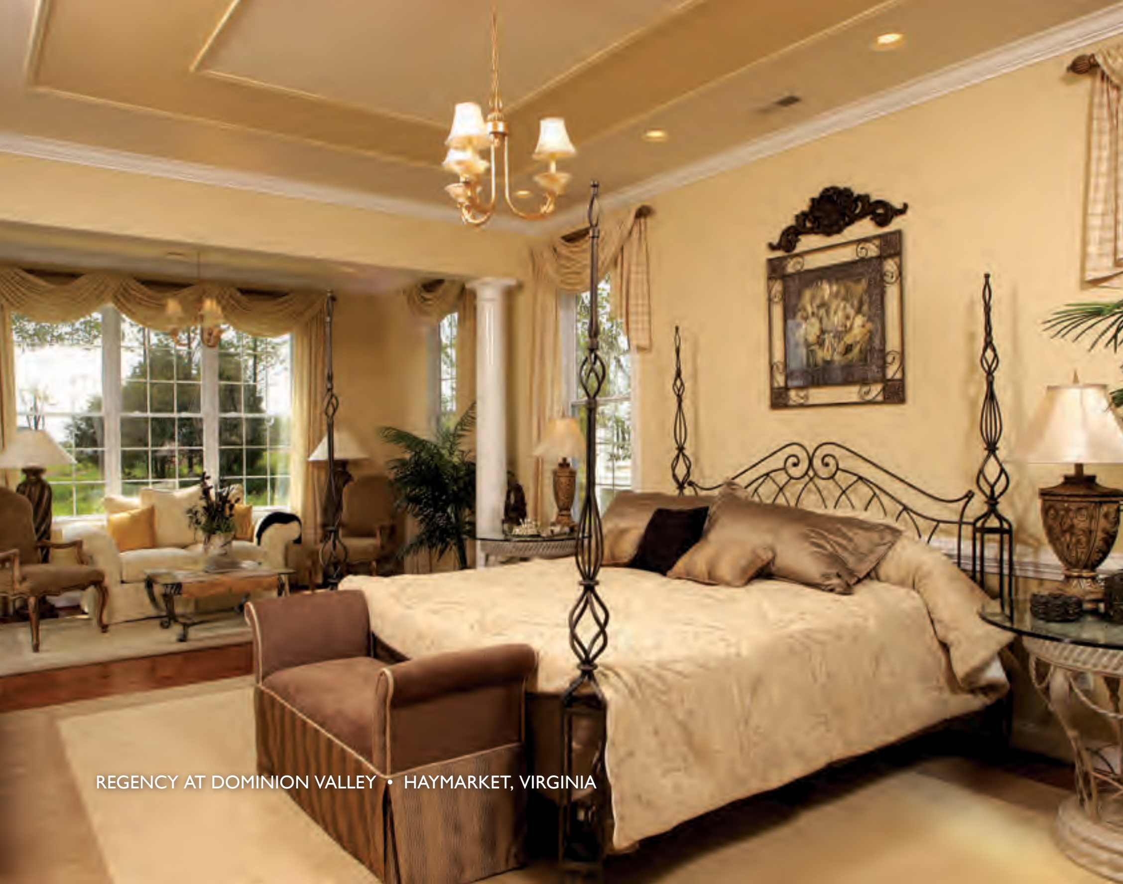
REGENCY AT DOMINION VALLEY • HAYMARKET, VIRGINIA