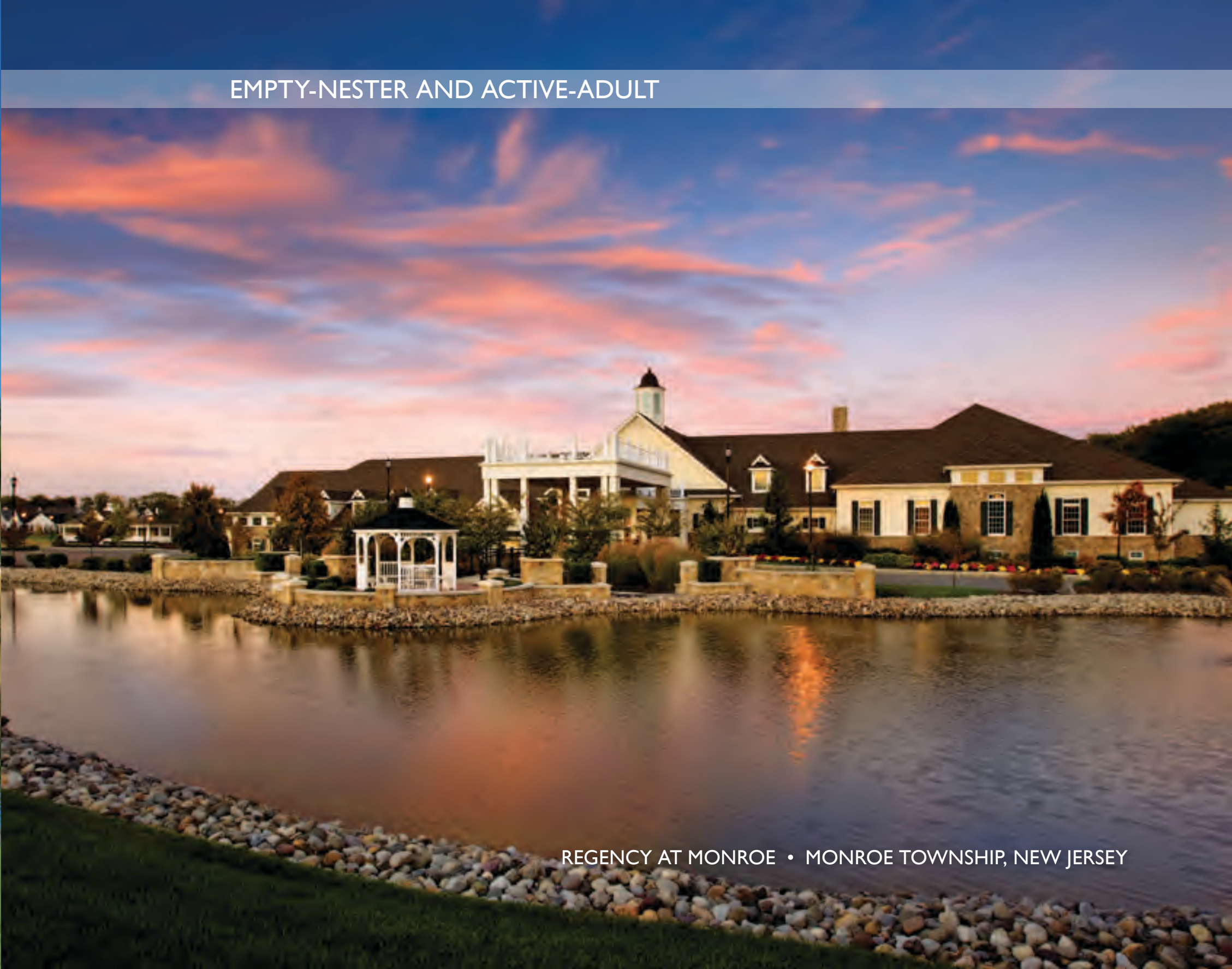
REGENCY AT MONROE • MONROE TOWNSHIP, NEW JERSEY