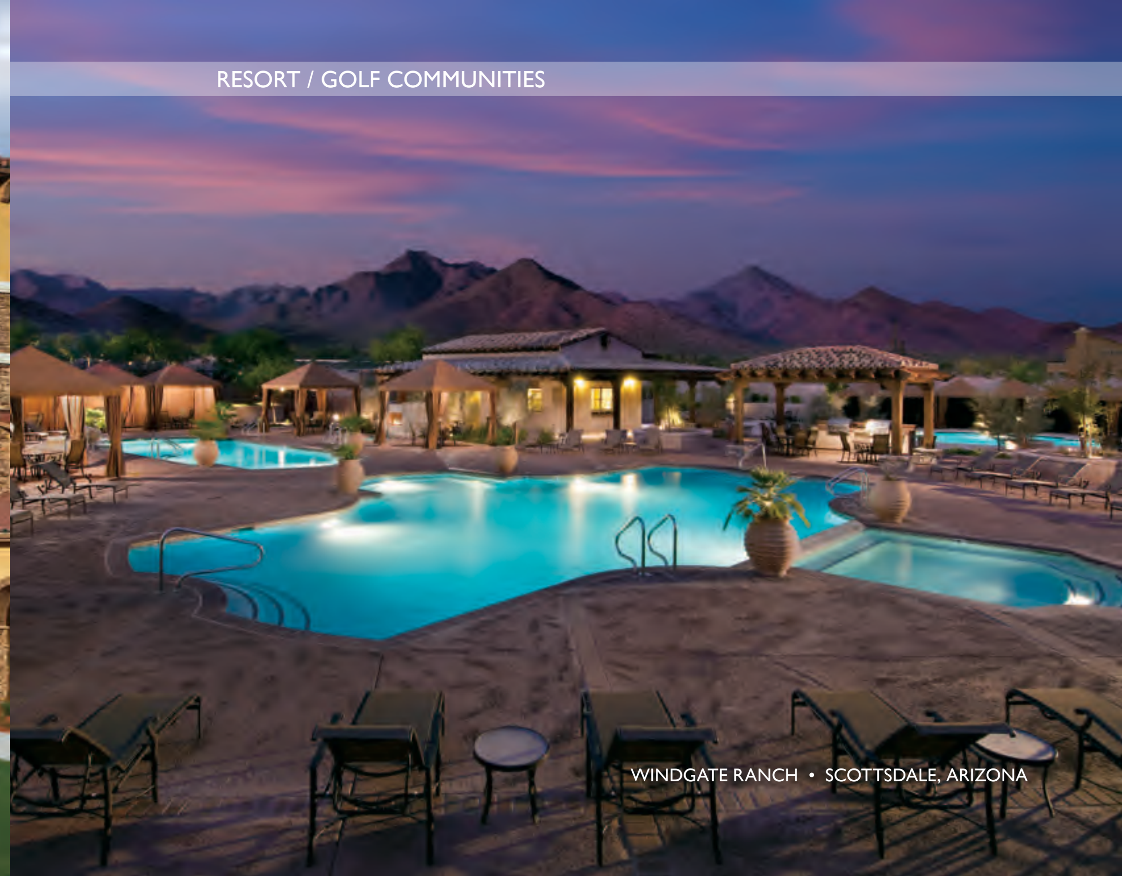
WINDGATE RANCH • SCOTTSDALE, ARIZONA