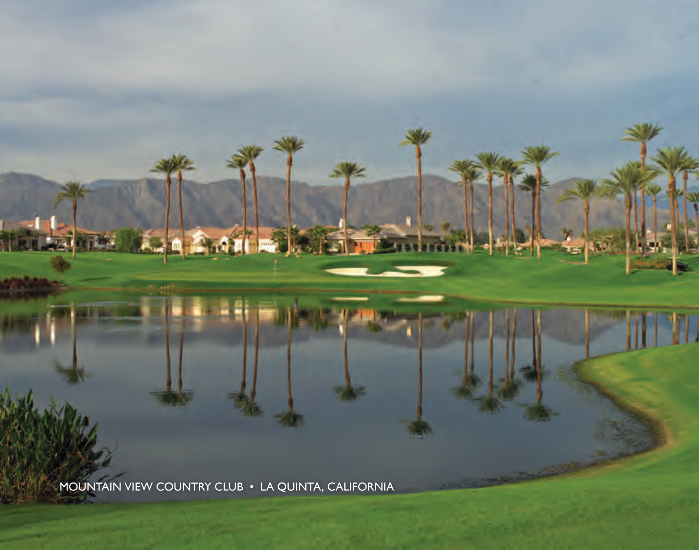
MOUNTAIN VIEW COUNTRY CLUB • LA QUINTA, CALIFORNIA