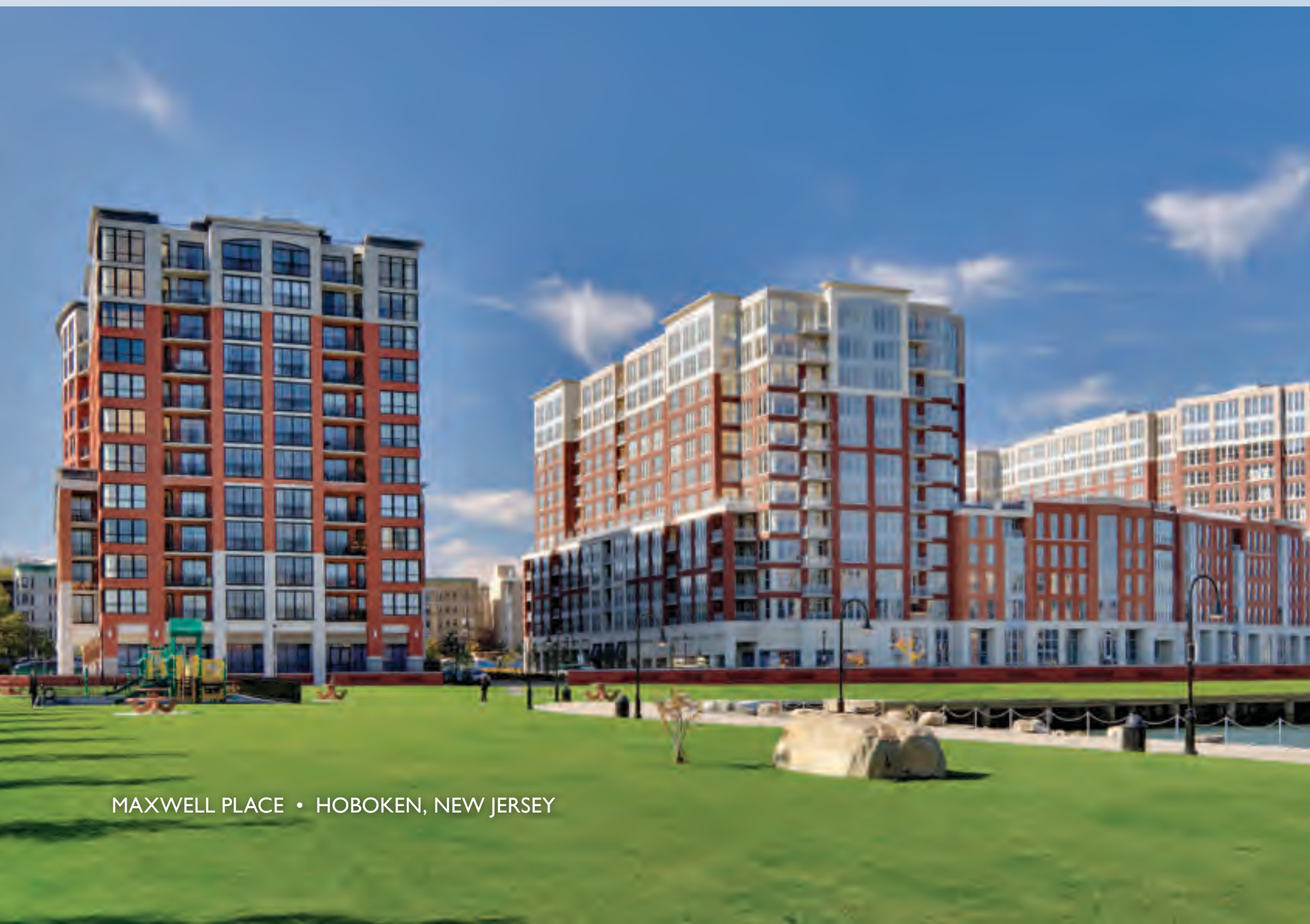
MAXWELL PLACE • HOBOKEN, NEW JERSEY