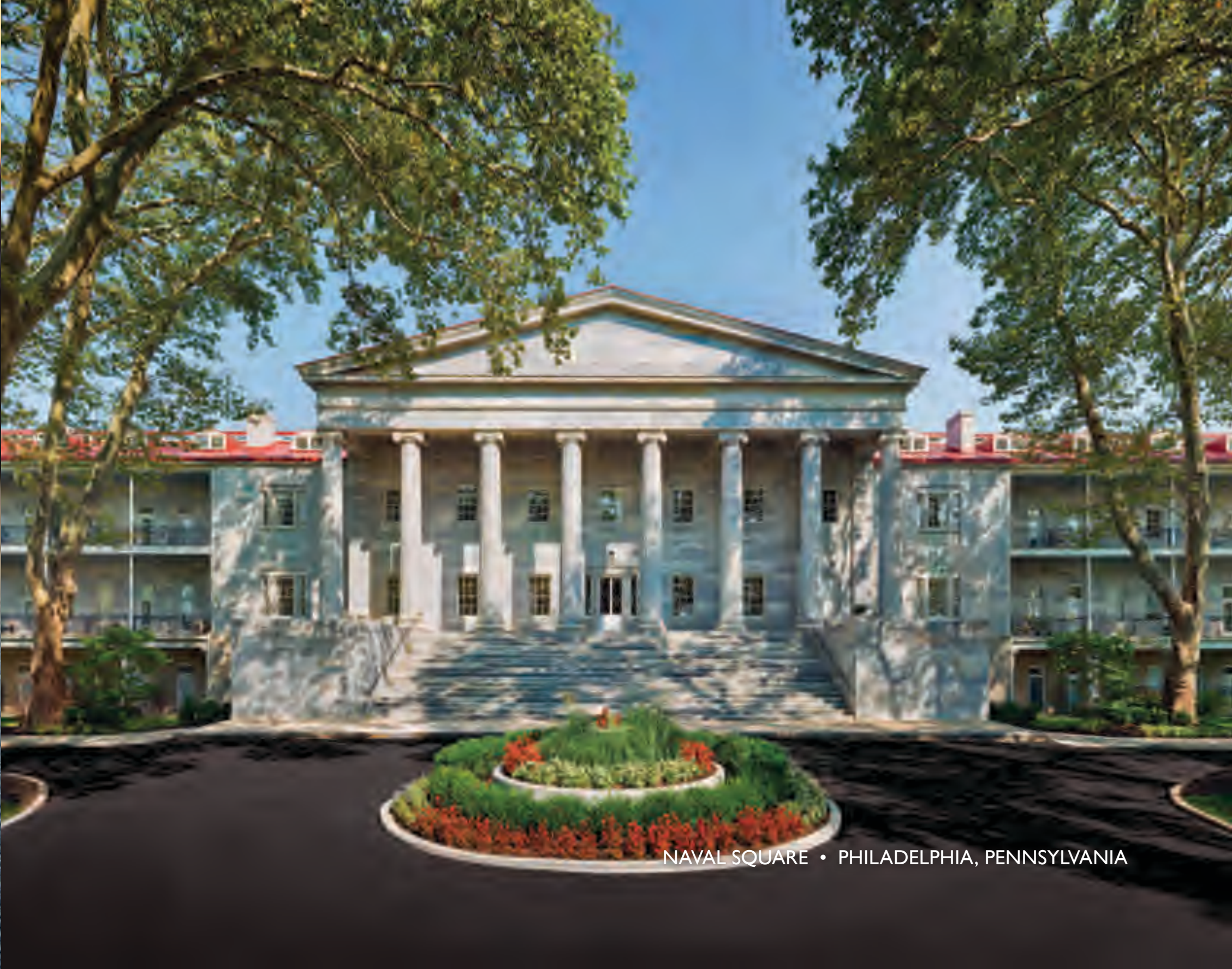
NAVAL SQUARE • PHILADELPHIA, PENNSYLVANIA